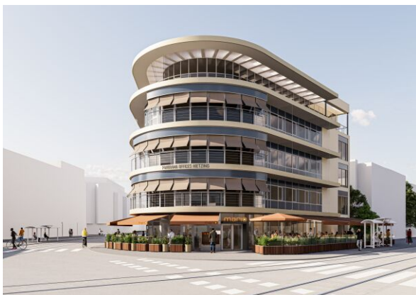
Randering Ansicht bei Tag