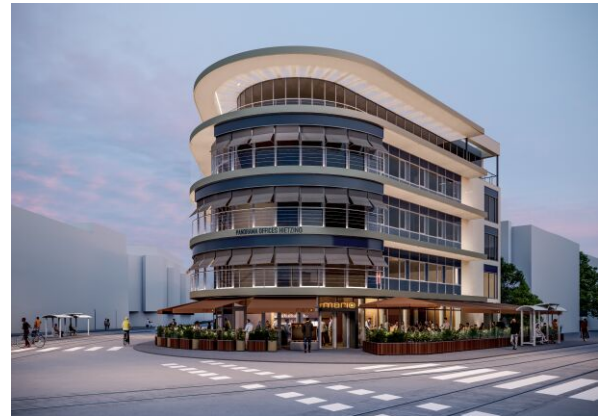
Randering Ansicht Abendstimmung